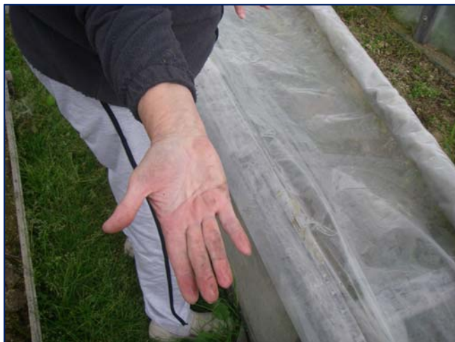
Thin coat of soot on the film, covering greenhouse with cucumbers. September 2009

Of course, you can doubt the connection between the sharp decline in productivity and the beginning of intensive, day to day operations of the LNG plant and OET as much as you want. However, the fact that trees and bushes in 2009 had lost productivity in comparison with 2002 remains, and it is difficult to blame anything but emissions from the LNG factory. Especially when the equipment on the dacha properties is covered with various pollutants: