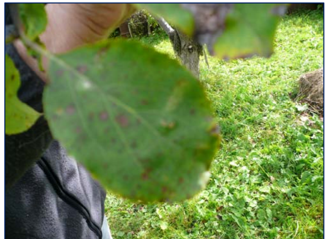
Plum tree without berries in September 2010. Usually gardeners reap the harvest from it in October.