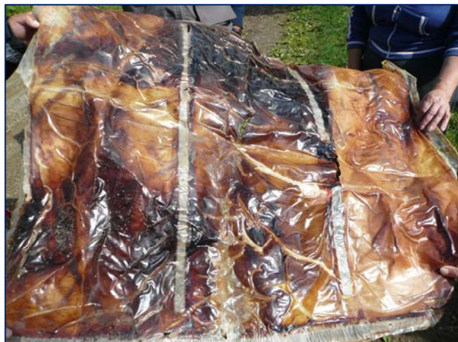
Coat of the brown-yellow substance on the film, covered a window on a dacha house during the winter 2008 - 2009.