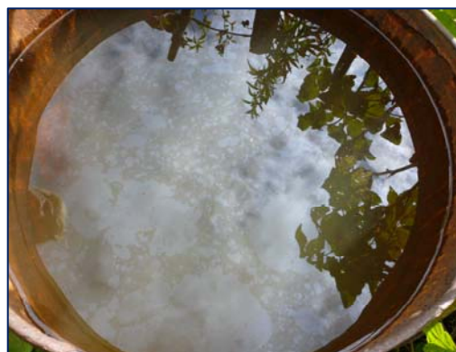
Oily iridescent rainbow-pearl film on the top of water stored in barrels for irrigation. June 2010.